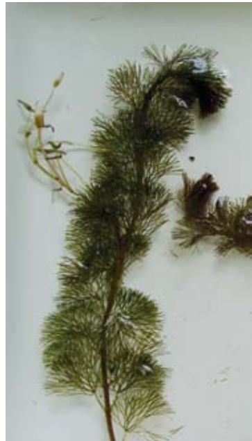
Long leaf stems and strictly opposite arrangement are key features