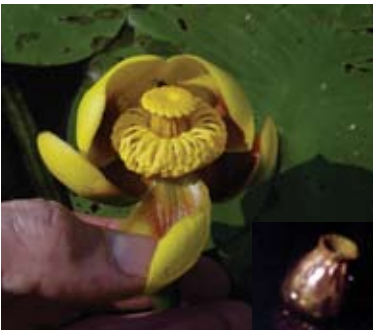
The flowers are yellow and ball-shaped; the stigmatic disk develops into a vase-shaped seedpod (inset)