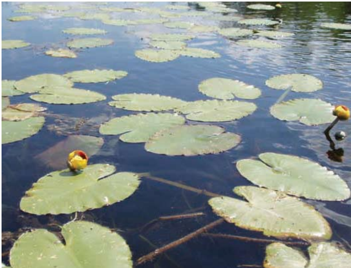
Spatterdock leaves may grow up to 40 cm long

Look Alikes: May be confused with European frogbit, yellow floating heart, small and large yellow pond lilies (both species uncommon in Maine and not included in this guide), little floating heart, watershield, and fragrant water lily.