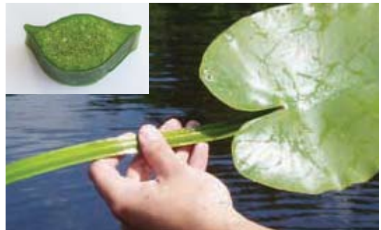
The leaf stalks are thick and elastic Stem cross-section (inset) resembles a smile